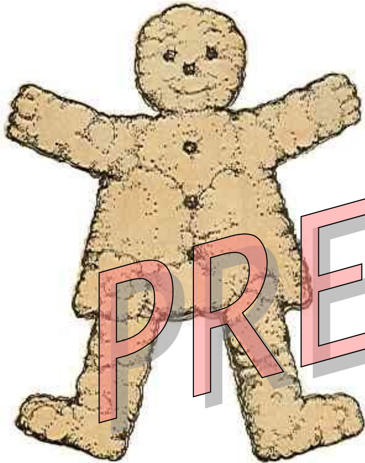
The Gingerbread Boy